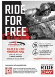
Flier 5in x 7in