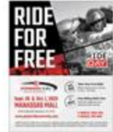
Social Media 4:5 (1080px x 1350px)