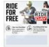
Social Media 1:1 (1080px x 1080px)

Editable templates with designated space for event specific information.