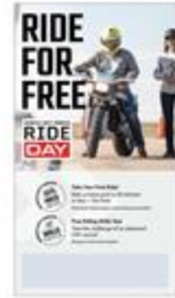
Social Media 9:16 (1080px x 1920px)