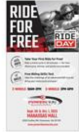
Social Media 9:16 (1080px x 1920px)