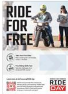
Flier 5in x 7in