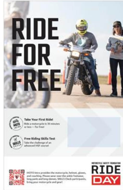
Poster 11in x 17in