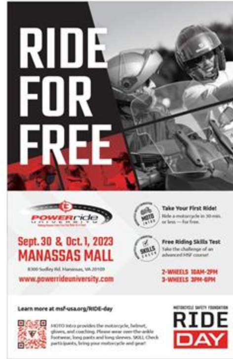
Poster 11in x 17in