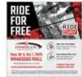
Social Media 1:1 (1080px x 1080px)