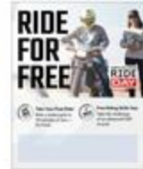
Social Media 4:5 (1080px x 1350px)